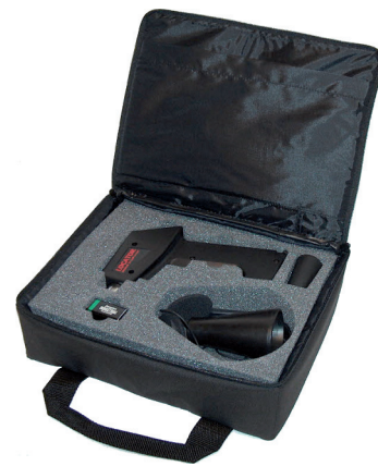
Supplied in a case with all the required accessories

The turbulence generates a broad spectrum of sound. There are ultrasonic components in the sound and since the ultrasound will be the loudest by the leak site, the detection of these signals using the LOCATOR ® is usually quite simple.